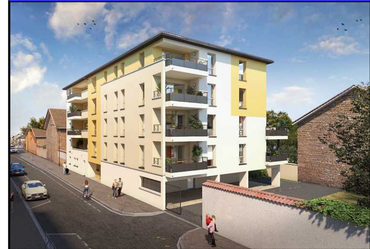
URBAT PROMOTION - Immeuble OXYGENE - 1401, Avenue du mondial 98 CS 68214 - 34965 Montpellier cedex 2