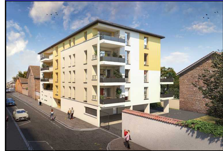
URBAT PROMOTION - Immeuble OXYGENE - 1401, Avenue du mondial 98 CS 68214 - 34965 Montpellier cedex 2