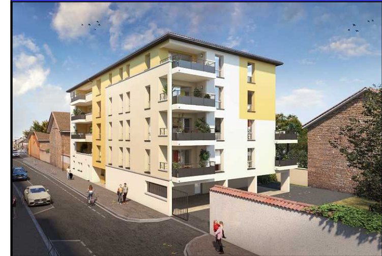
URBAT PROMOTION - Immeuble OXYGENE - 1401, Avenue du mondial 98 CS 68214 - 34965 Montpellier cedex 2