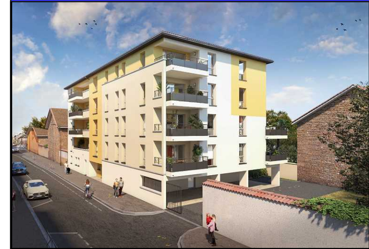
URBAT PROMOTION - Immeuble OXYGENE - 1401, Avenue du mondial 98 CS 68214 - 34965 Montpellier cedex 2